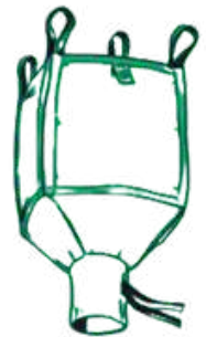
CONICAL DISCHARGE SPOUT