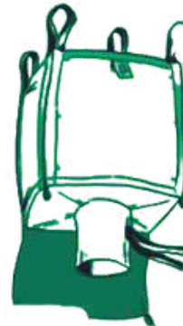
DISCHARGE SPOUT w/ FLAP