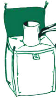
SPOUT TOP w/ FLAP