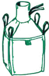
CONICAL SPOUT TOP